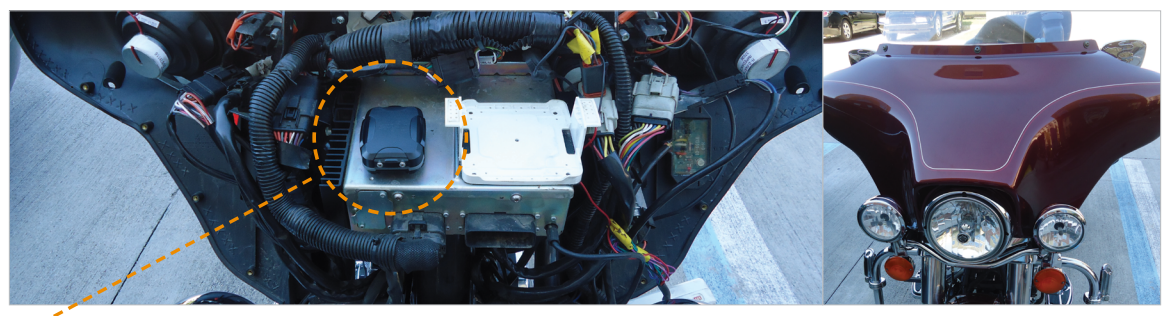
SPOT Trace mounted under the fiberglass fairing of a motorcycle using the included Velcro strip and mounting bracket.

SPOT Trace mounted inside a fiberglass compartment of a boat using the included Velcro strip and mounting bracket. Notice the unit is angled toward the sky for optimal performance.